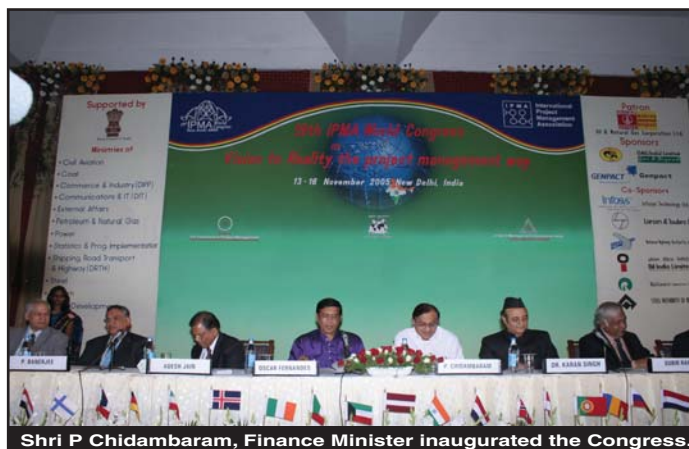
Shri P Chidambaram, Finance Minister inaugurated the Congress.