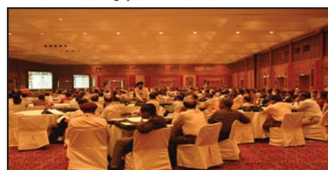
(2007) Over 500 delegates from 20 countries participated in the Global Symposium.